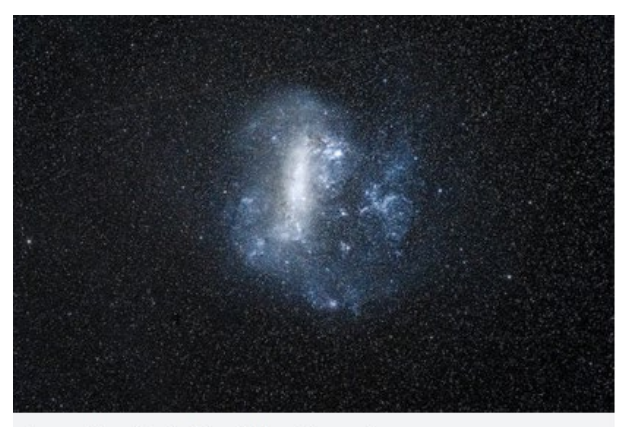
Large Magellanic Cloud (stock image). Credit: © Camille / stock.adobe.com

Date: April 21, 2021 Source: NASA/Jet Propulsion Laboratory