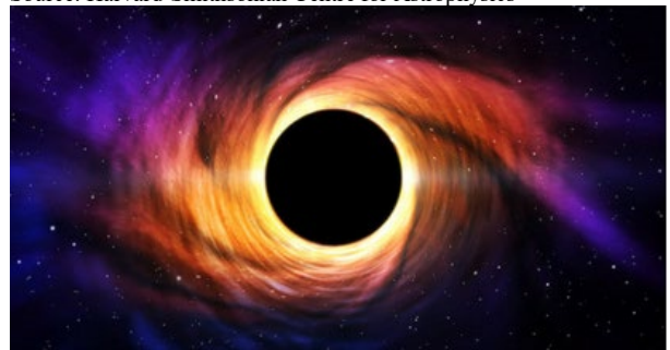
Black hole illustration (stock image).

Telescopes unite in unprecedented observations of famous black hole Date: April 14, 2021 Source: Harvard-Smithsonian Centre for Astrophysics