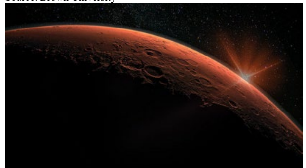
Mars illustration (stock image; elements furnished by NASA). Credit: © elen31 / stock.adobe.com

Date: April 22, 2021 Source: Brown University